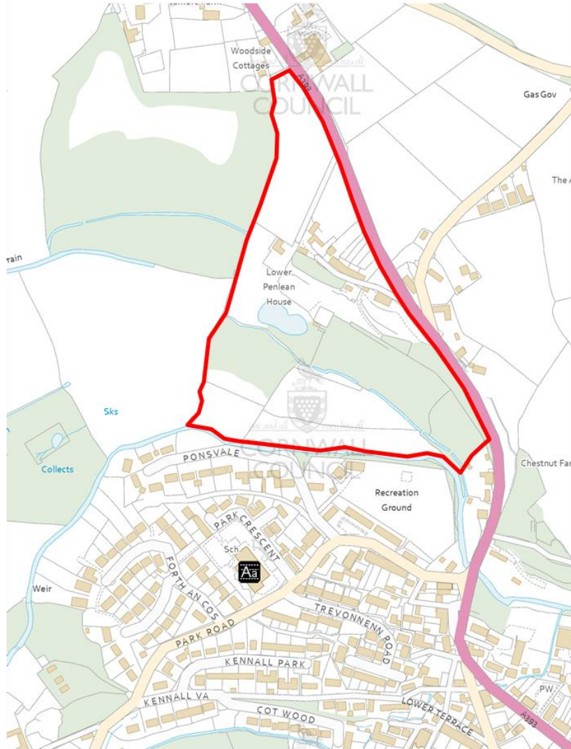
Northern Village Proposed Footpath Location